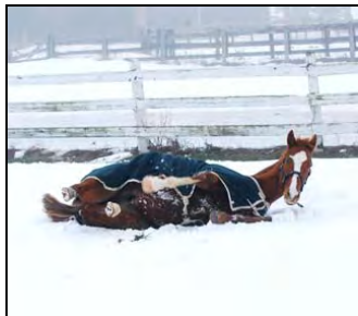
Nemo enjoying the snow in his blanket

It is just as important that you look after yourself! In order to be warm and comfortable you should dress in layers , because you definitely will warm up – the only cold person will be the instructor!