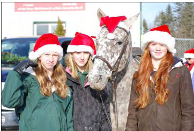
Santa Claus Parade in Mount Albert, 2009

A: Because the horse hugs the rails, the jockey puts his arms around the horse and you can kiss your money goodbye.